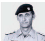
General (Retired) Ulrich K. Wegener Founder and First Commander, GSG 9, Federal Police of Germany