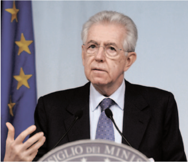
Honoree 2012: Professor Mario Monti, PhD

Since 2010 ESMT has honored inspiring leaders demonstrating a deep commitment to the principles of sustainability by awarding them the ESMT Responsible Leadership Award. This year's recipient is Professor Mario Monti, President of the Council of Ministers and Minister of Economy and Finance of the Republic of Italy.