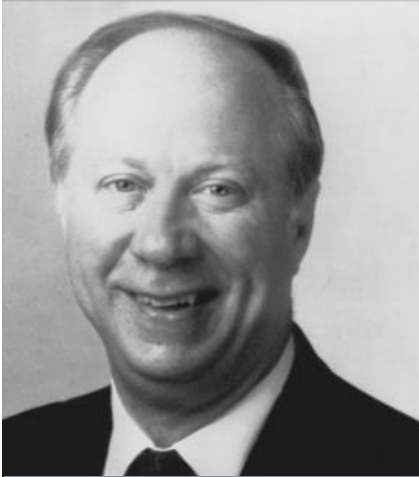
David R. Gergen

Director of the Center for Public Leadership at Harvard, author of Eyewitness to Power: The Essence of Leadership, Nixon to Carter , political commentator, and former adviser to four presidents.